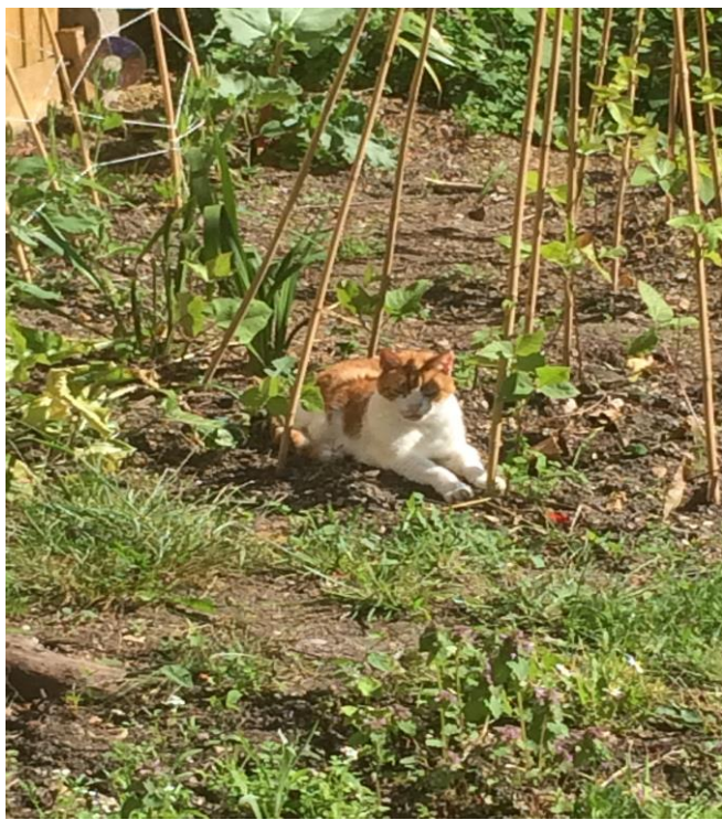
Lucky topping up her sun tan.

Lucky has been having a fairly easy time now that the warmer weather has arrived, she has ventured outside into the presbytery garden and is out of quarantine after her recent holiday to Spain.